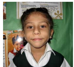
Walida - PKK ...blue