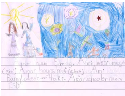
Emily, Grade 1G