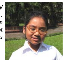
Taufika, 4W Reflective... having my own opinion not other peoples